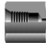
F -ANSI/ASME B1.20.1 Internal pipe threads